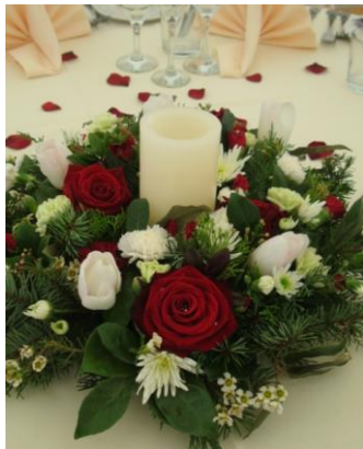
Flowers by our own Florist